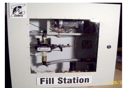
Zebra Fill-Station, using Zebra Proportioning Pump