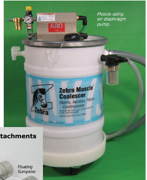
Muscle using air diaphragm pump.