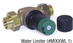
Water Limiter (#MIXXWL.1)