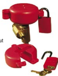
Mixer Lockout #MIXXLock